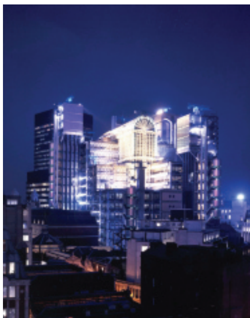
Lloyd's building in London